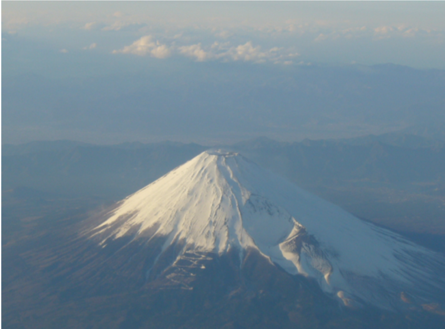
Mt. Fuji, Japan